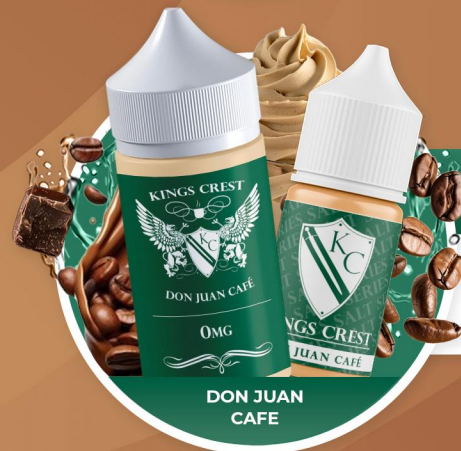
DON JUAN CAFE

The roasted flavor of peanuts layered into its signature mix of graham cracker, chocolate & butter pecan.