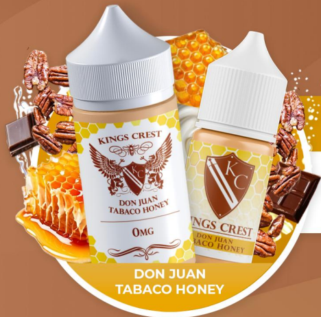
DON JUAN TABACO HONEY