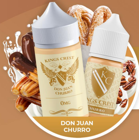
DON JUAN CHURRO

Don Juan Reserve flavor has been brought to new levels with the addition of a smooth Honey Tabaco.