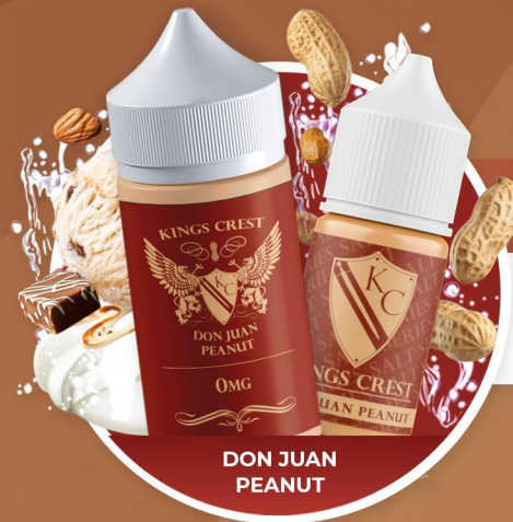
DON JUAN PEANUT

The warm, cinnamon-sugar delight of a freshly fried churro—layered over buttery graham crust.